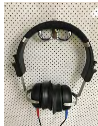
Internal equipment hooks