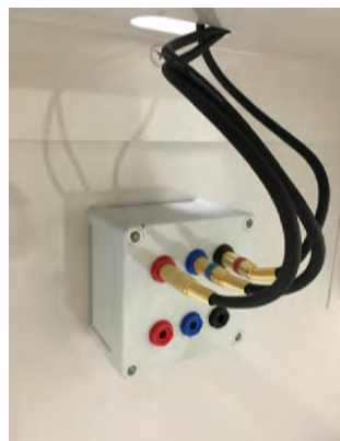
Cable connection panel