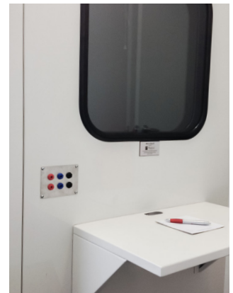
External equipment shelf