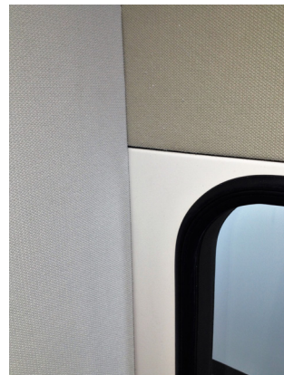
Acoustic fabric interior