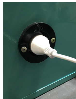
Mains powered light and fan assembly